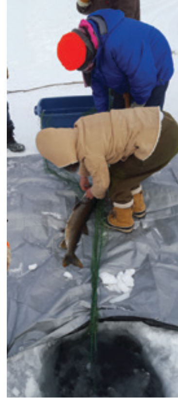
Above: Youth netting fish at Youth Camp