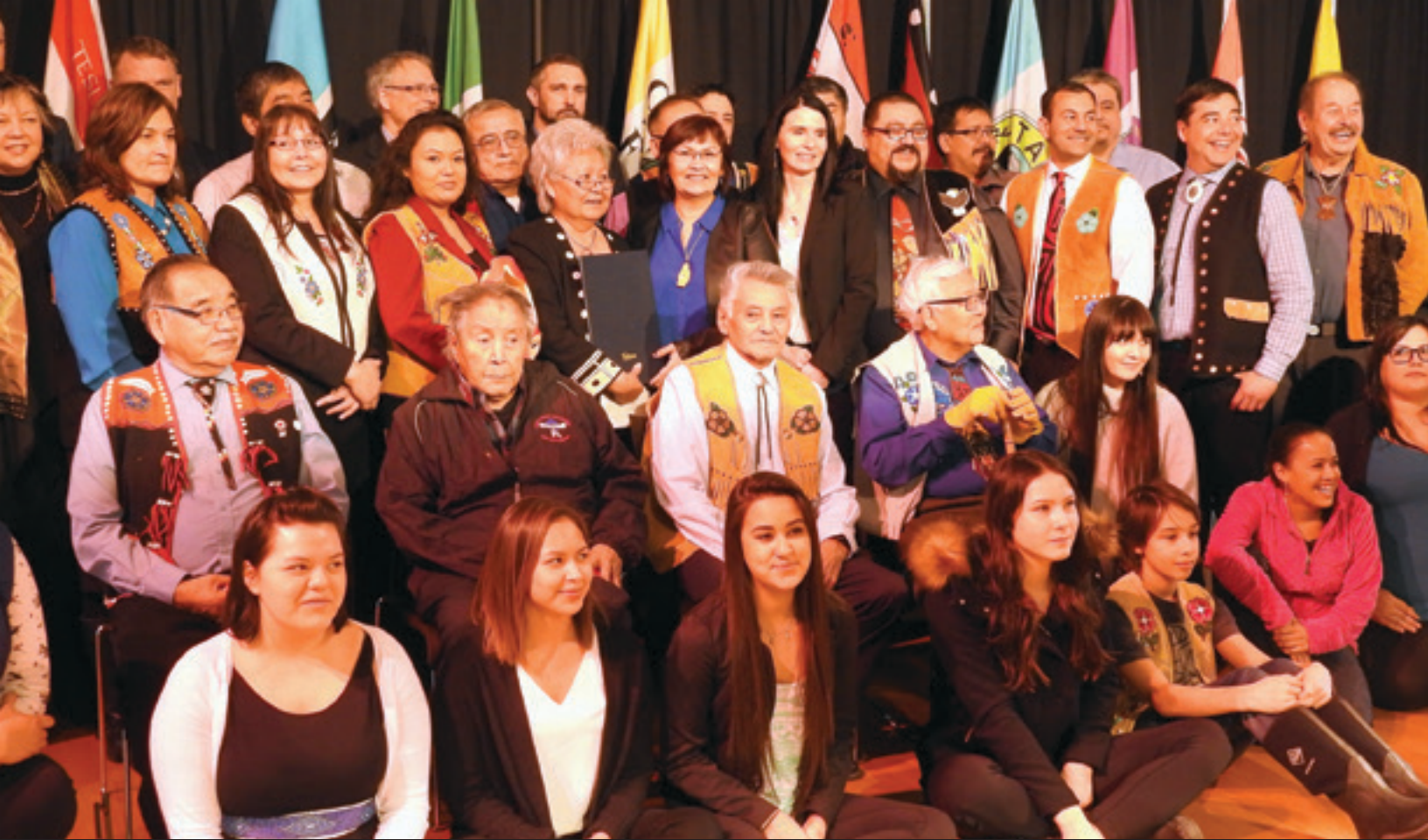
Photo: Elders, First Nation Chiefs, Yukon Premier, Government of Yukon Ministers, Grand Chief of the Council of Yukon First Nations and youth at the January 13th Yukon Forum