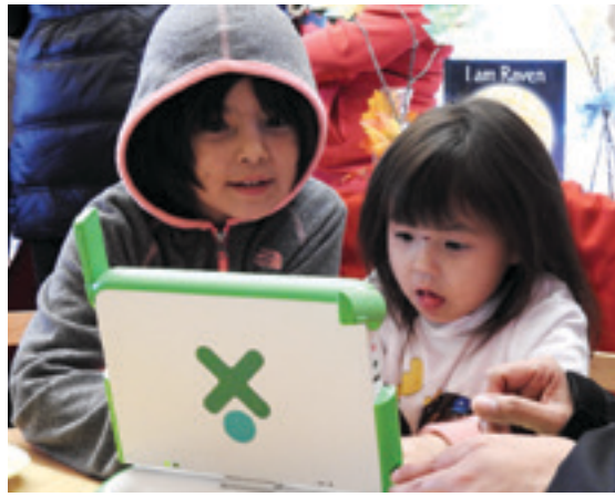
Left: One Laptop per Child event at Dusk'a Head Start Family Learning Centre

questions that seemed that they were really invested in people's wellbeing. She says they inquired into whether KDFN has the resources to best serve the children and provide adequate language programming. "This is a chance to make