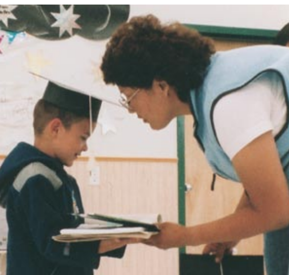
2006 HeadStart grad.