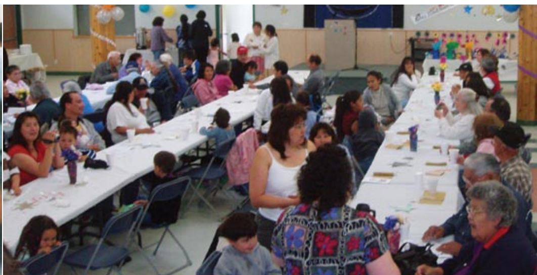
KDFN celebrates as a community at the 2007 HeadStart grad.