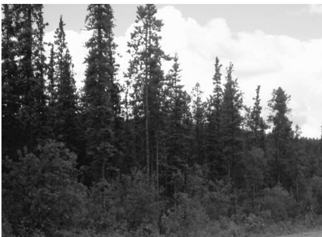
Woods in the KDFN Traditional Territory near Mount McIntyre.

Also from the Capital Department, KDFN has recently completed the first phase of the 2007 FireSmart contract for the Whitehorse Copper Subdivision, which is the new Yukon government development project in the Mount Sima area. The first phase saw 12 KDFN members employed to clear 25 hectares of wood. In the second phase, to happen this fall, KDFN members will clear and burn 6.5 kilometres of brush from the trails in the new subdivision.