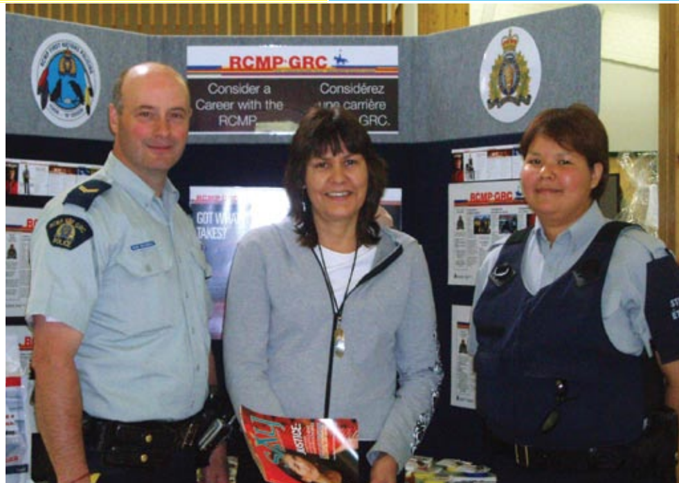
The RCMP was on hand during the 2007 Open House looking to recruit new members.

We will be known forever by the tracks we leave.