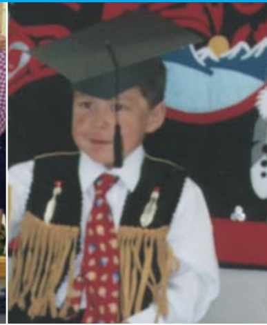
2006 HeadStart grad.