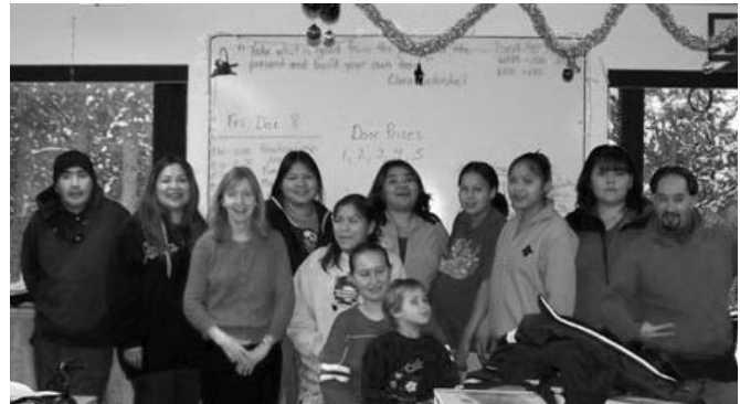
House of Learning students celebrating Christmas 2007.

HR will be developing a new initiative to address the gap that we see for those KDFN citizens who have some basic education and training but lack work experience. We are looking at mentorships and under-fill placements to help them.